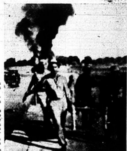
EVACUATION—A Pakistani Army medical team carried away a soldier wounded when an Indian plane strafed a Pakistani truck (burning in the background) on a road in the Jaurian area of Indian Kashmir.

Mr. Thant, on the first leg of a peace-seeking tour, which will also take him to New Delhi, met with Marshal Ayub at the peak